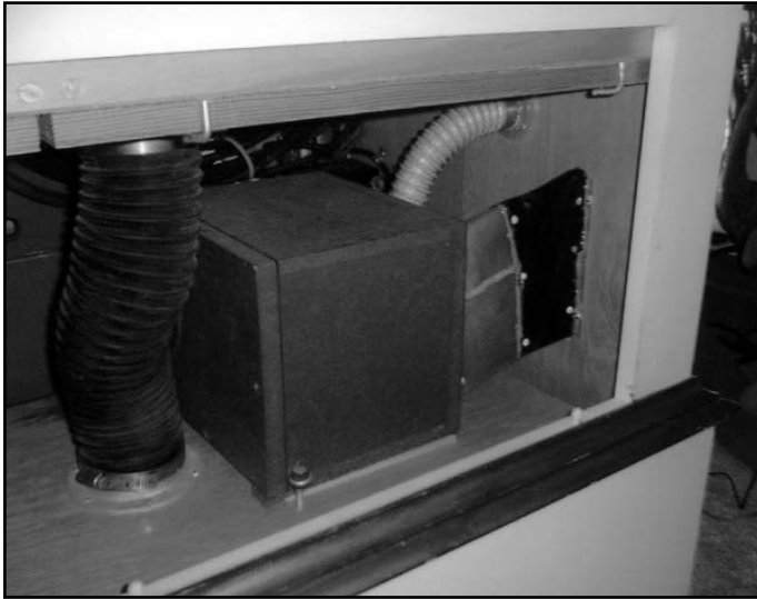
Figure 4. The revised venting of the vacuum pump to the outside of the organ case.

I purchased my organ ( Figures 2 & 3 ) in 1994 from Mr. MacKinnon's son. The organ sat for a number of years and the plastic tubing had turned to oil and soaked the Wurlitzer unit valves. After rebuilding the unit valves and retubing the organ, it